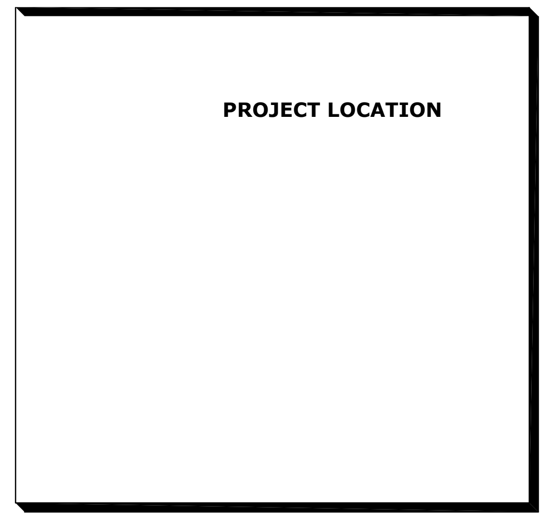
LOCATION MAP N.T.S.